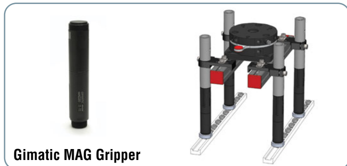
Gimatic MAG Gripper